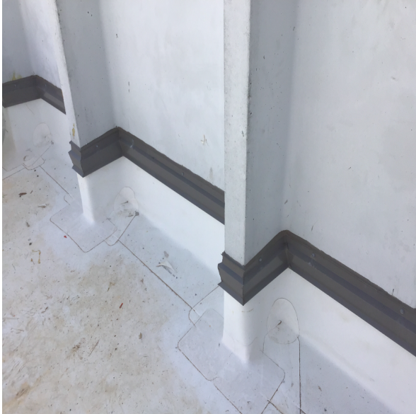
Begin installing coping at the roof.