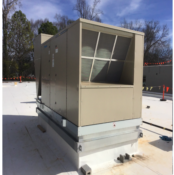
All roof mounted HVAC units are set.