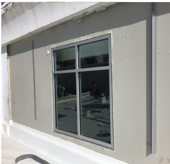
Begin installing new glass and storefront in area 3